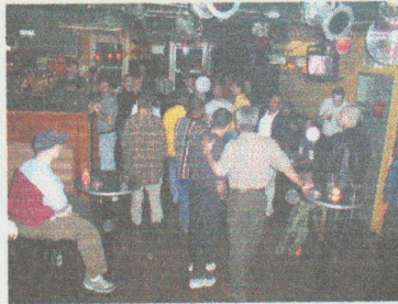
Actual photo from Social

About the party Fire Island Poz Socials Ft.Lauderdale Aids Ride 6 Transportation First Aid Phone List info